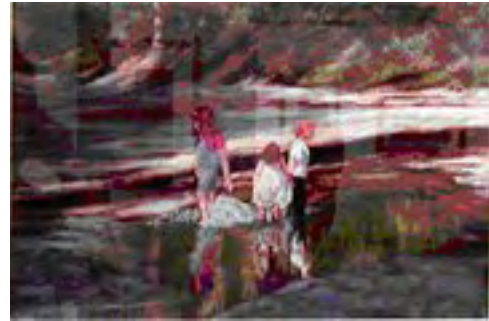
“Summertime and the Living is Easy”