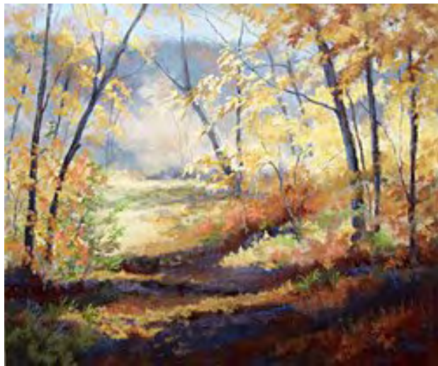
Aflame With Desire

The paintings are, “Passing Though” and “Aflame With Desire”. They were juried into the Pastel, Colored Pencil, Graphics Division. The Show can be viewed at artjury.com .