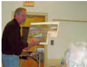
I WAS WAITING FOR SOMEONE TO ASK THAT QUESTION