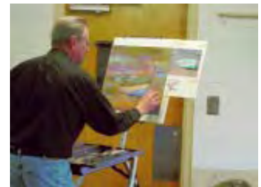
HERE'S THE WAY YOU DO IT