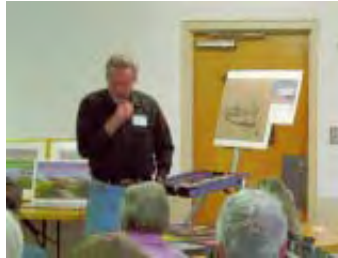
WOW, THAT'S A TOUGH ONE