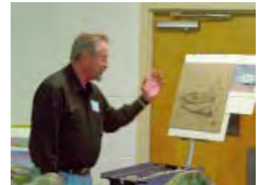
DRAW IT OUT AND THEN GO FOR IT