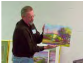
AIN'T MY BABY PRETTY