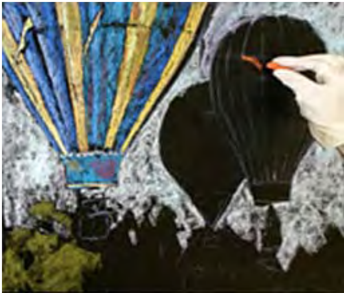
Hot Air Balloons Phase 2

It was exciting to watch the progression of the paintings.