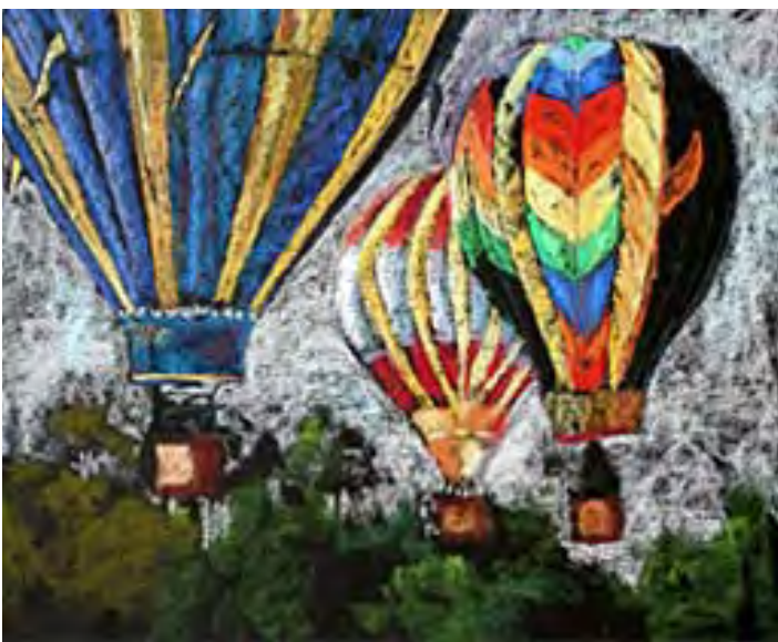
Hot Air Balloons Phase 3