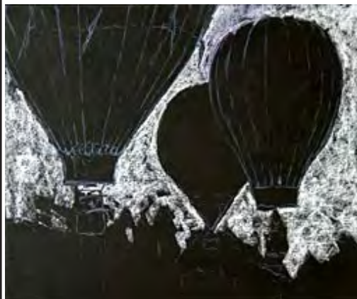
Hot Air Balloons Phase 1

It was a great opportunity to explore and try different supports as there were a variety of papers used. The traditional Canson was used, as well as Art Spectrum, and Wallis pastel paper.