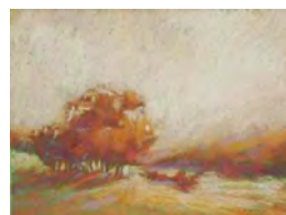
"Transforming Light 1"