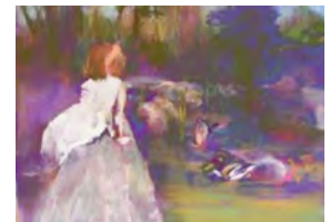
"Duck, Duck, Goose"