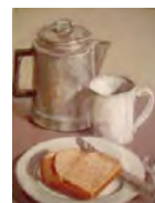
"Coffee and Toast"