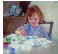
"Primary Colors + One"