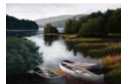
People's Choice Award "End of Day"