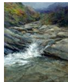
Honorable Mention "Autumn Tum ble"