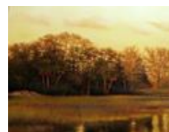
3rd Place "Jaune Brilliant"