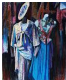
Honorable Mention "White Dress"