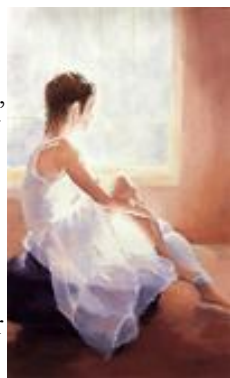
"A Time For Me"