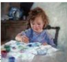
"Primary Colors Plus One"