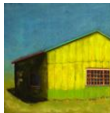
Honorable Mention "Little Green House"