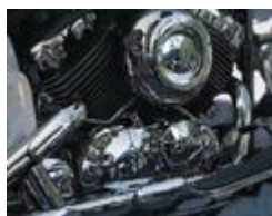
1st Place "Blue Motorcycle"