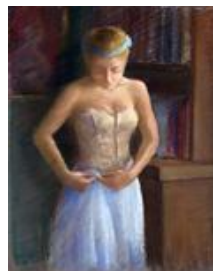
Honorable Mention "Last Minute Adjustment"