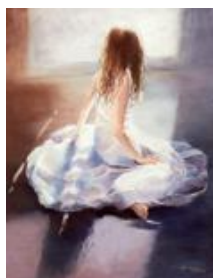
2nd Place "Lovin' the Spin I'm In"