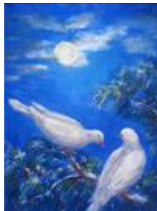
"Under the December Moon"