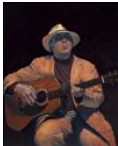
"Sharing A Heritage"