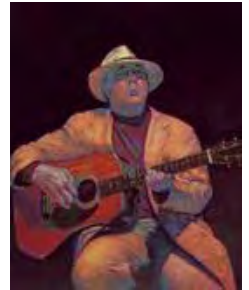
"Sharing A Heritage"