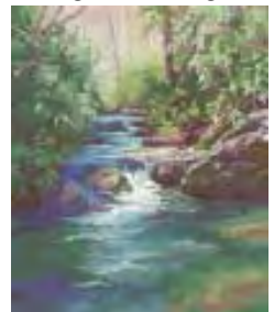
"Tumbling...Into The Pond"

View Kate's portfolio in the "Master Class Plus" at www.artjury.com