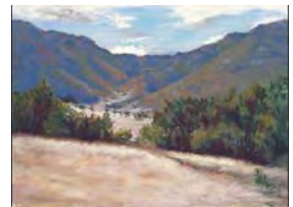
"A Distant Meadow"