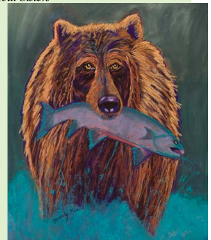
"Lunchtime on the River"