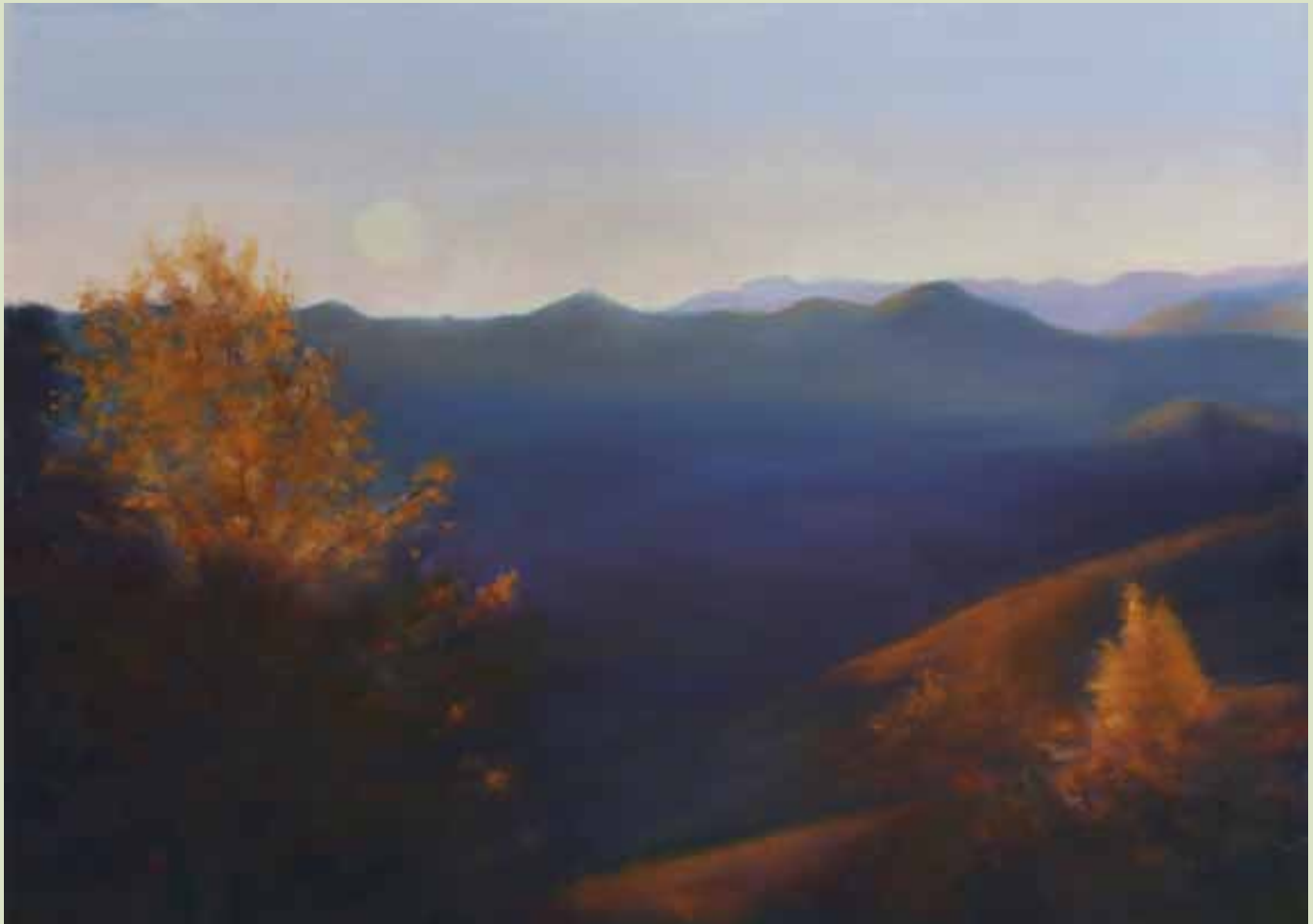
Into The Night