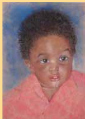
I wanted to work with pastels, so I took photos of the child in the lower apartment and did this on suede mat board.