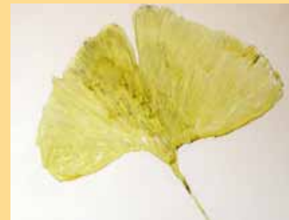
"Gingko Leaf", watercolor

I moved to the mountains in NC, after soaking up the heat in Las Vegas for 5 years. Here I began taking classes in pastel and watercolor painting.