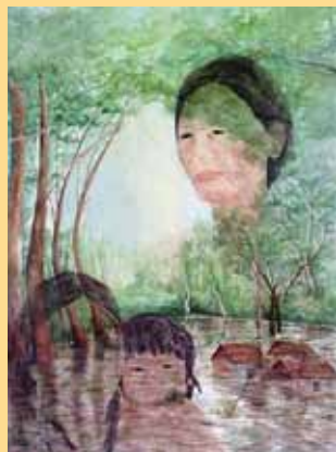
A pieces incorporating several scenes from the Amazon: