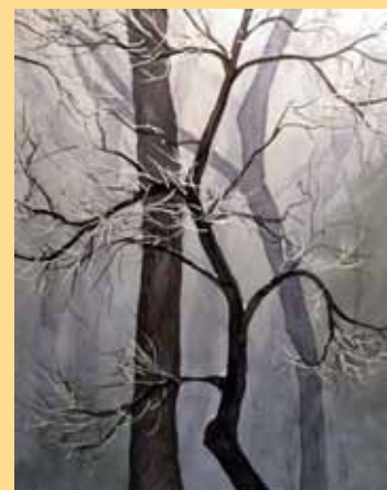
"Frosted Tree", watercolor

class would ohh and ahh and say something nice about each drawing...until it was my turn. There was dead silence (and I knew that was BAD!). Finally the teacher jumped in and said something like, "How interesting, it was done with 4 different perspectives". I stayed after class to ask her to show me, and she mumbled something, I don't remember what.