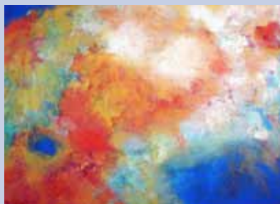
"Fires and Rain - Sacred Ground"

pastel and everything in between - anything that would help me view form, shape and composition differently than 'the real world' we see around us. I live 13 miles away from The Penland School of Craft in