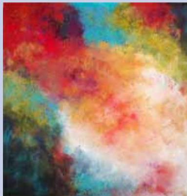
"Fires and Rain - Consumed"

As you know, there is nothing like the intensity and brilliant color of Pastel, and it is my favorite medium to work in, too. But my interest in abstraction has led me to work in acrylic, oil, oil