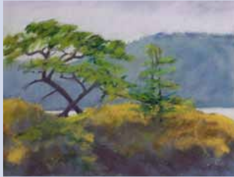
"Tree Crossed Path"