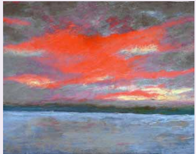
"New Port Sunset"