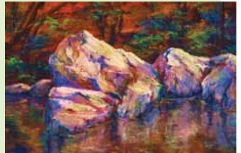
"Connausaga River Rocks"