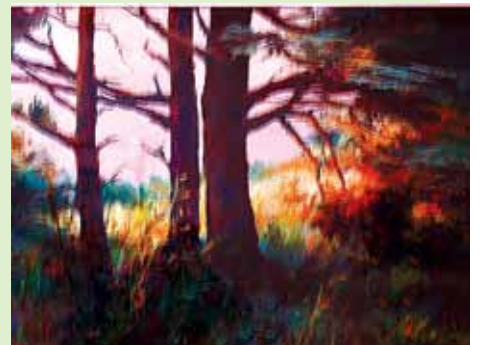
"Monhegan Trees II"