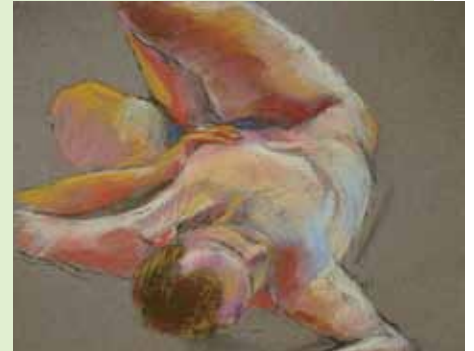
"Male Nude II"

Currently my paintings are in collections belonging to Coca Cola, Kimberly Clark, Bell South, ATT, and many banks and hospitals throughout mid- GA. My painting, 'James Island Marsh', was chosen for the '55 and Better' Exhibition by the High Museum of Atlanta. It toured GA and then returned to the governor's office in Atlanta.