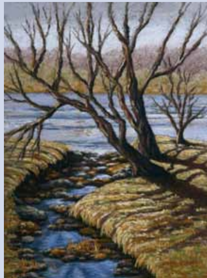
"Winter Sun Through Lattice"

Pastels are my favorite medium because I love the fresh brilliance of the colors and the depth that can be achieved using them. I am delighted to be a member of this outstanding group of artists---the Appalachian Pastel Society!