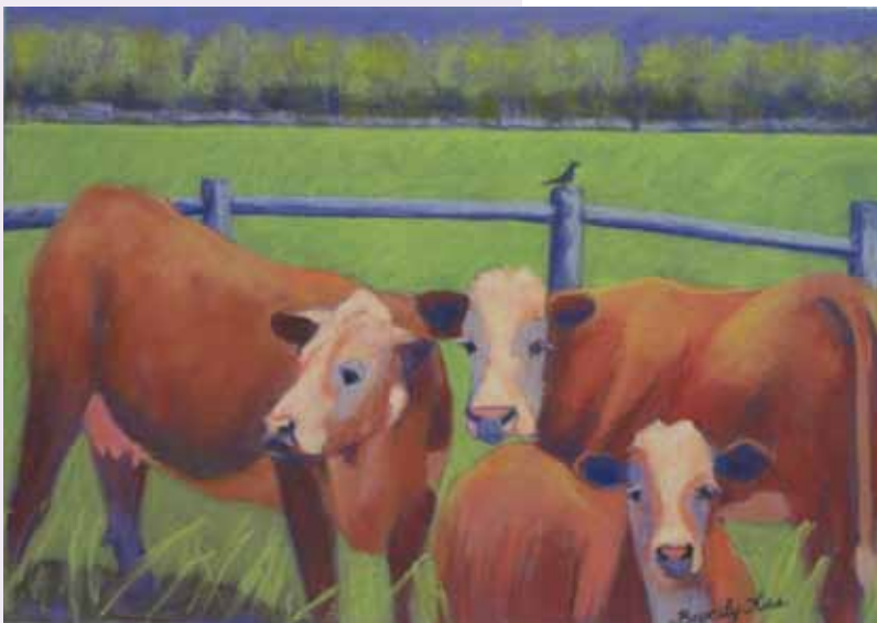
Front Range Meadow by Beverly Kies

will be the featured artist at Salon Blue Ridge in Hendersonville the month of April. The design showroom is located at 518 S. Allen Rd. www.blueridgearts.net .