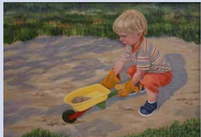
"Helping Daddy Get'er Done"