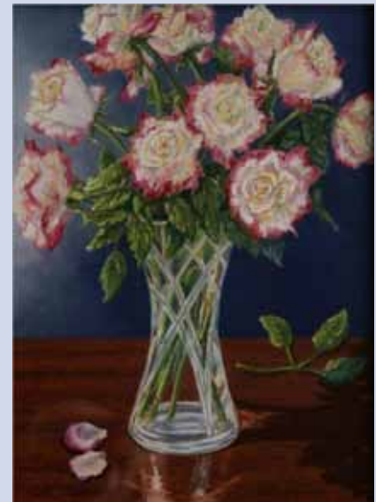
"A Gift of Double Delight"