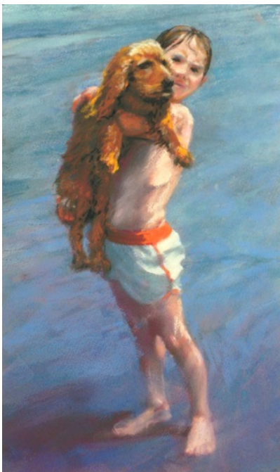
Jim Smythe - Beach Pals