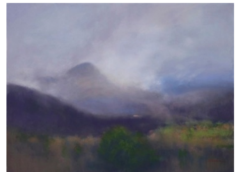
Quantum Field 18 x 24 pastel on Wallis paper