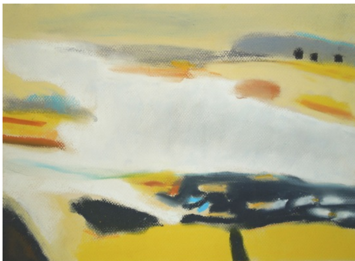
Rosemary Curtin (Continued on p. 5)