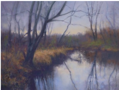
Sanctuary Marshlands 18 x 24 pastel on Wallis paper

Dates: February 26, 2015 thru April 24, 2015