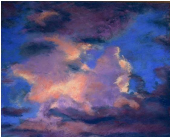
Nancy Clausen - Storm's End

The reception is April 16, 5:30 pm to 7:30pm