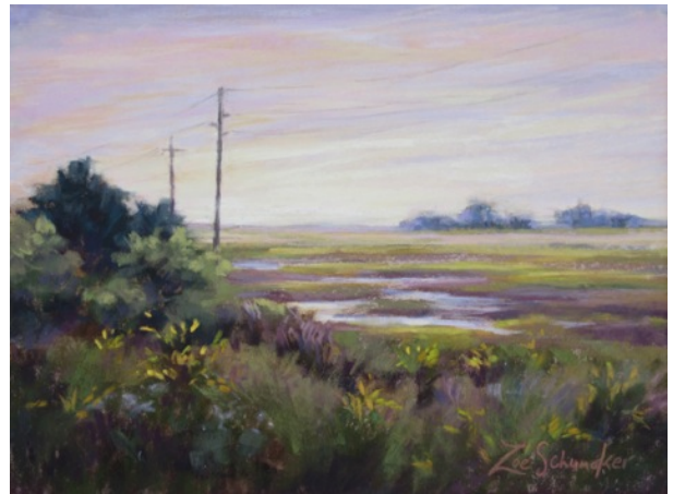
Zoe Schumaker - Causeway Vista and Queens and Clover