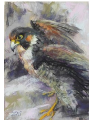
Falcon Study (2016) heading in a new direction