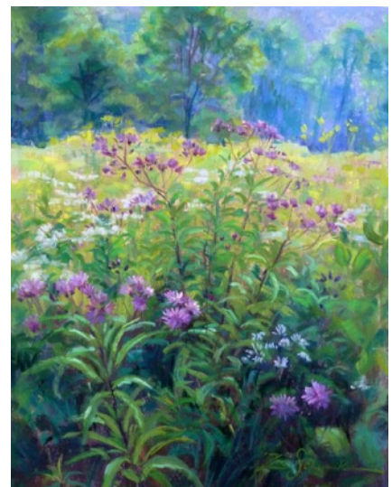
Ironweed Bouquet (2012) focusing on wildflowers

(Artist of the Month - Continued on p. 4)