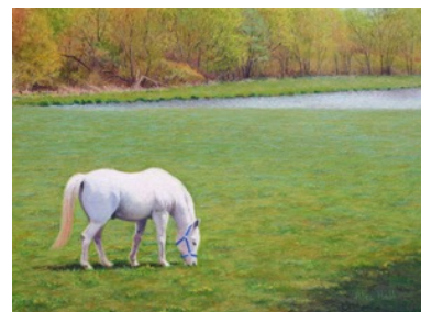
Caballo Blanco, Alec Hall