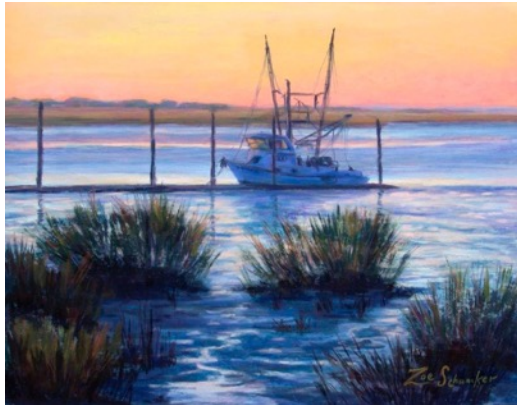
Shrimper, at Sunset (2015) a Jekyll Island inspiration

In 2014, after eight years of painting in the mountains, I had the opportunity to do a solo exhibition at Goodyear Cottage Gallery on Jekyll Island. I wanted to paint local scenes for this show, so I embarked on a one-year “detour” to the coast. Painting new subjects -- marshes, beaches, and birds -- really energized me. It also spurred a new interest, painting wildlife (especially birds) in nature.