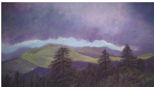
Weather in Motion, Beverly Kies