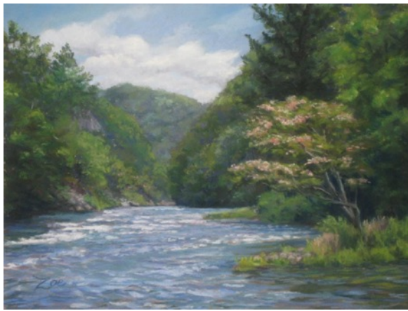
Riverside Mimosa (2008) an early plein air piece

I've always enjoyed drawing and painting, but, for most of my life, I was just a dabbler. Only upon retiring and moving to the mountains did I begin a more purposeful artistic journey. My sojourn started at the John C. Campbell Folk School in Brasstown, NC in 2006, where I took classes in watercolor, drawing, acrylic and oil painting, ultimately focusing on pastel.