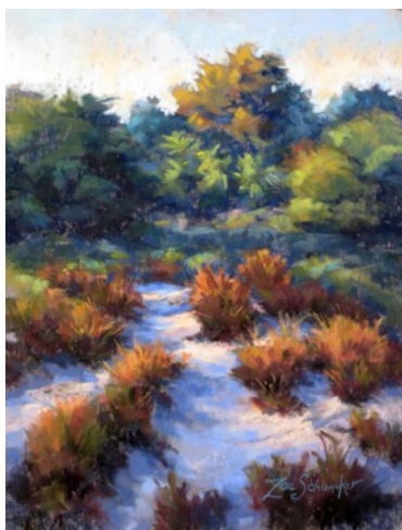
Dune Sanctuary (2014) exploring the Georgia Coast

In 2009, I joined the Southeastern and Appalachian Pastels Societies, enjoying the comradery and taking advantage of the workshops they offered. I began doing more studio work, experimenting with different grounds, underpaintings and techniques. In this "science" phase, I really tried to push the limits of the medium.