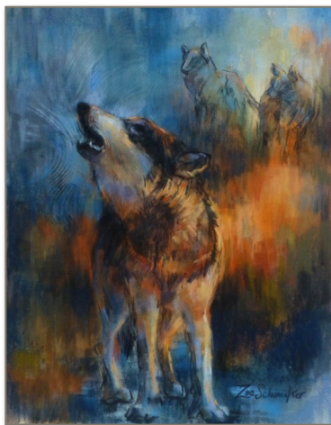
"Howl" Zoe F Schumaker