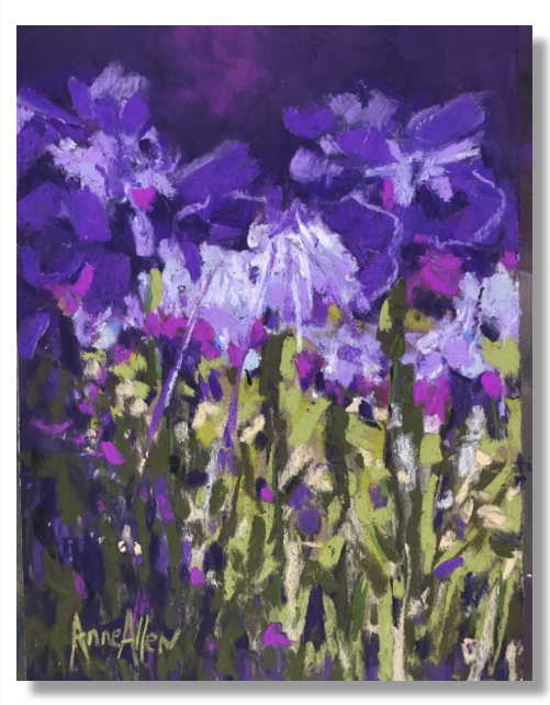
Violet in Bloom