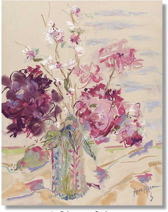
La Primavera Spring