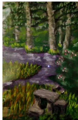
Deep Forest Path 6 x 4

Much appreciation to all who participated and shared their paintings and their comments!