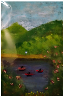
Beautiful Day on the Lake 6 x 4

“Painted today at Price Lake in Boone, N.C. Took 3 friends to our cabin and went out plein air painting. Beautiful weather. These are 4x6 Pastel on Uart 500 paper.