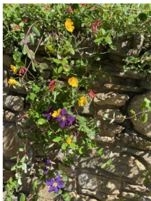
The Garden Wall 12 x 12