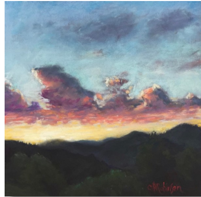
Cloud Parade 8 x 8 on Pastelmat