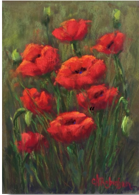
Memorial 8 x 6 on Pastelmat

A friend surprised me and took me out for a birthday dinner (my birthday is Monday the 15th), and when I got home the sky was glorious. So I decided to try to do a sunset while it was happening. If you ever want to learn to paint faster, this is a great exercise. The colors change pretty rapidly. There was time to block in the mountains while the sun was still up, so that helped. You can also block in the sky if you anticipate it getting darker. The light on the clouds is the hard part, it changes fast. I did have to finish in the house as I lost my light. The beauty of painting a sunset en plain air is that a photo just cannot give you the colors and depth that you see with the eye. The greens and blues in the mountains turn into black. Try it sometime, it’s fun. “