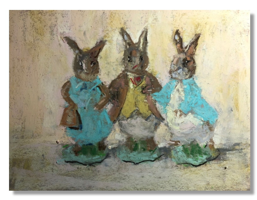
Art Spectrum pastel. Painted 3 of my favorite Beatrix Potter figurines today. Not frame worthy but did enjoy the process.