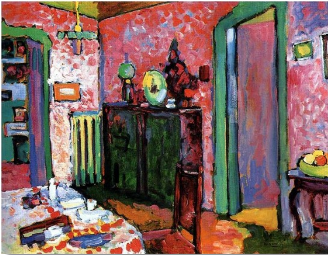
My Dining Room 1909 Wassily Kandinsky