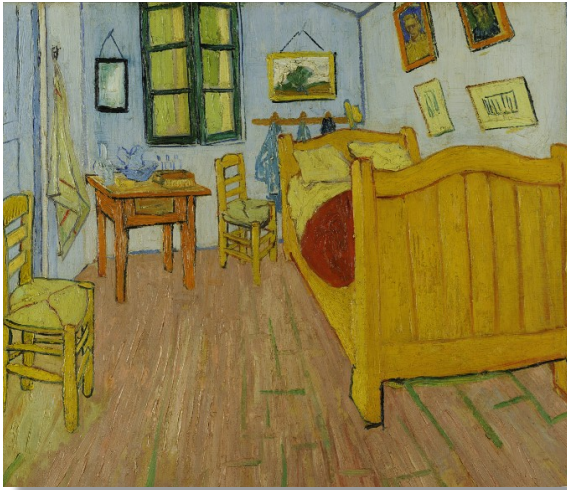
The Bedroom 1888 Vincent van Gogh