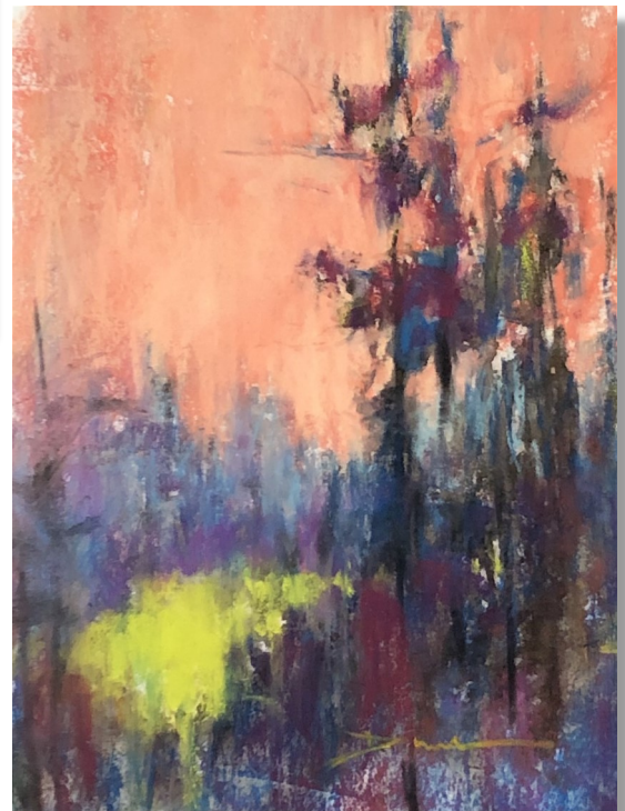
Lime Lawn 5 x 7

Then, just to switch it up, I chose a color I wouldn't normally choose (warm orange) and paint the same scene with optical split complements. Trying to stay fresh and not overwork ... I actually enjoyed my little painting session .. and it inspired me on to something larger!