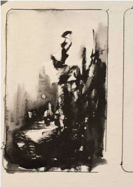
Mist & Mauve 5 x 7