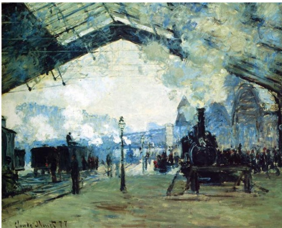
Monet: Normandy Train