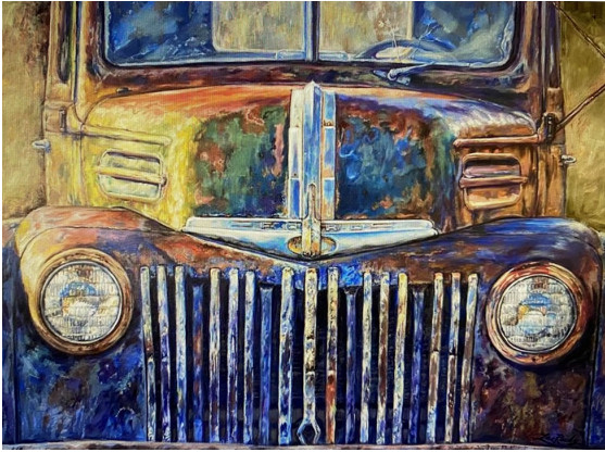
Lee Reedy: Pick Up