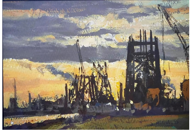
Bruce Mulcahy: Industrial Sunset, Teeside