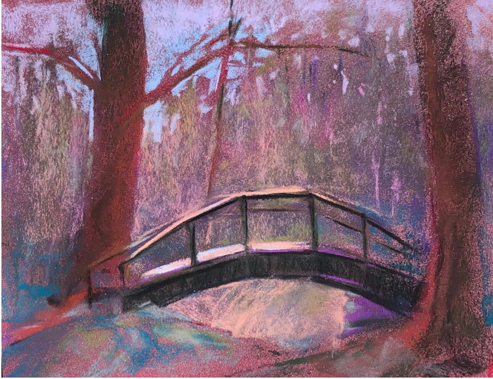
Dusky Bridge 9 x 12 UArt 400