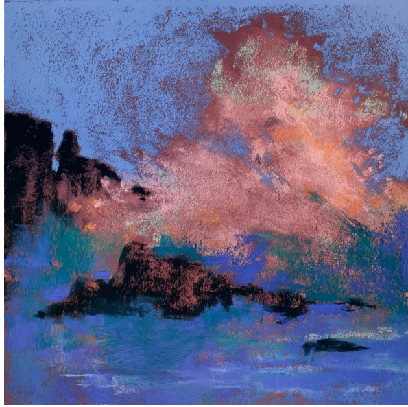
On the Rocks 10 x 10

These are the stages of my wave painting.