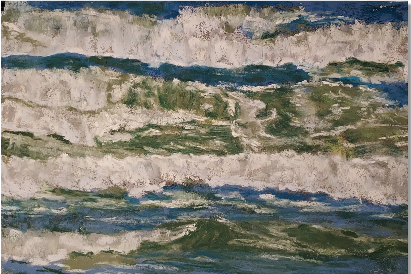
Daytona Waves 6 x 9

I will start by saying, I have a new found respect for artists who paint ocean waves.