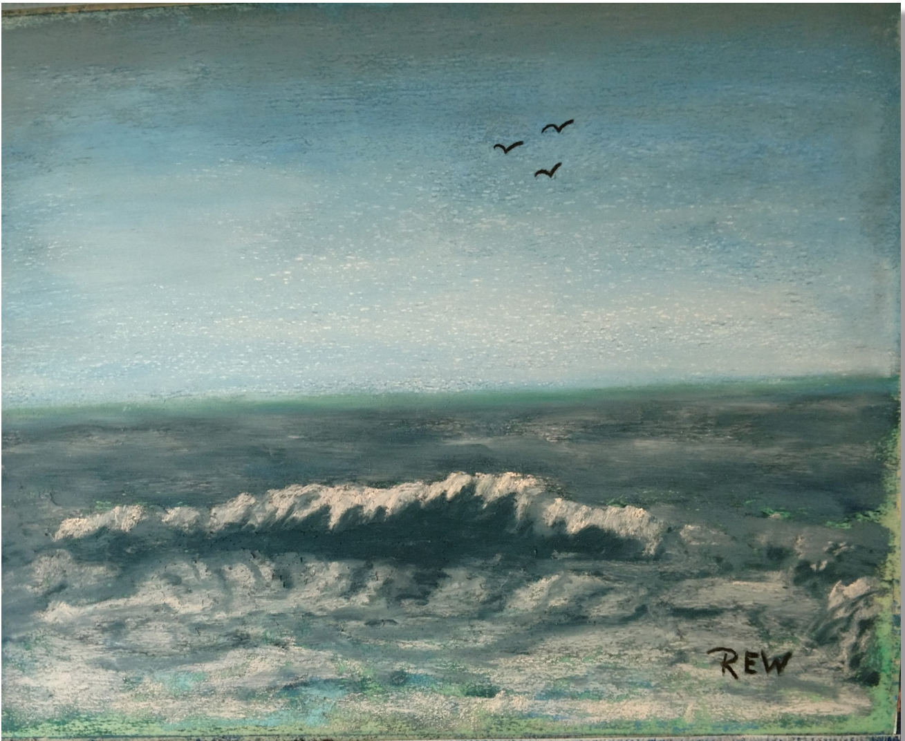
Gloomy Day at Myrtle Beach 8 x 10

Reference photo taken at Myrtle Beach a few years ago in April.