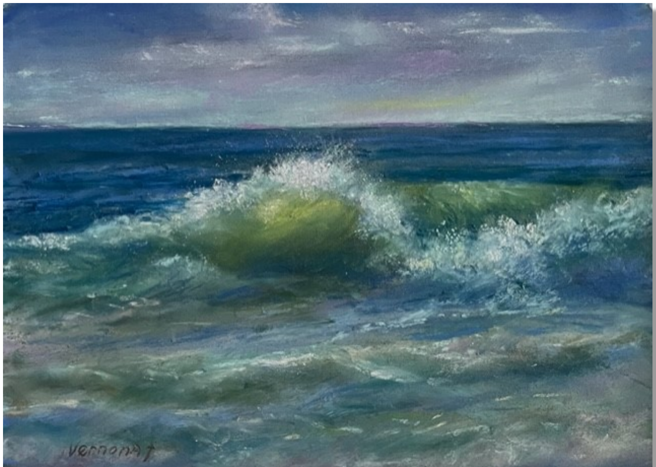
Matthew 8:27—from Memory

This painting is inspired by Scripture and the painting I gave my grandson and his wife.