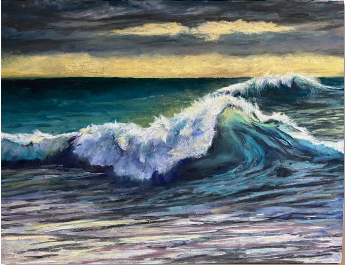
Wave in the Storm