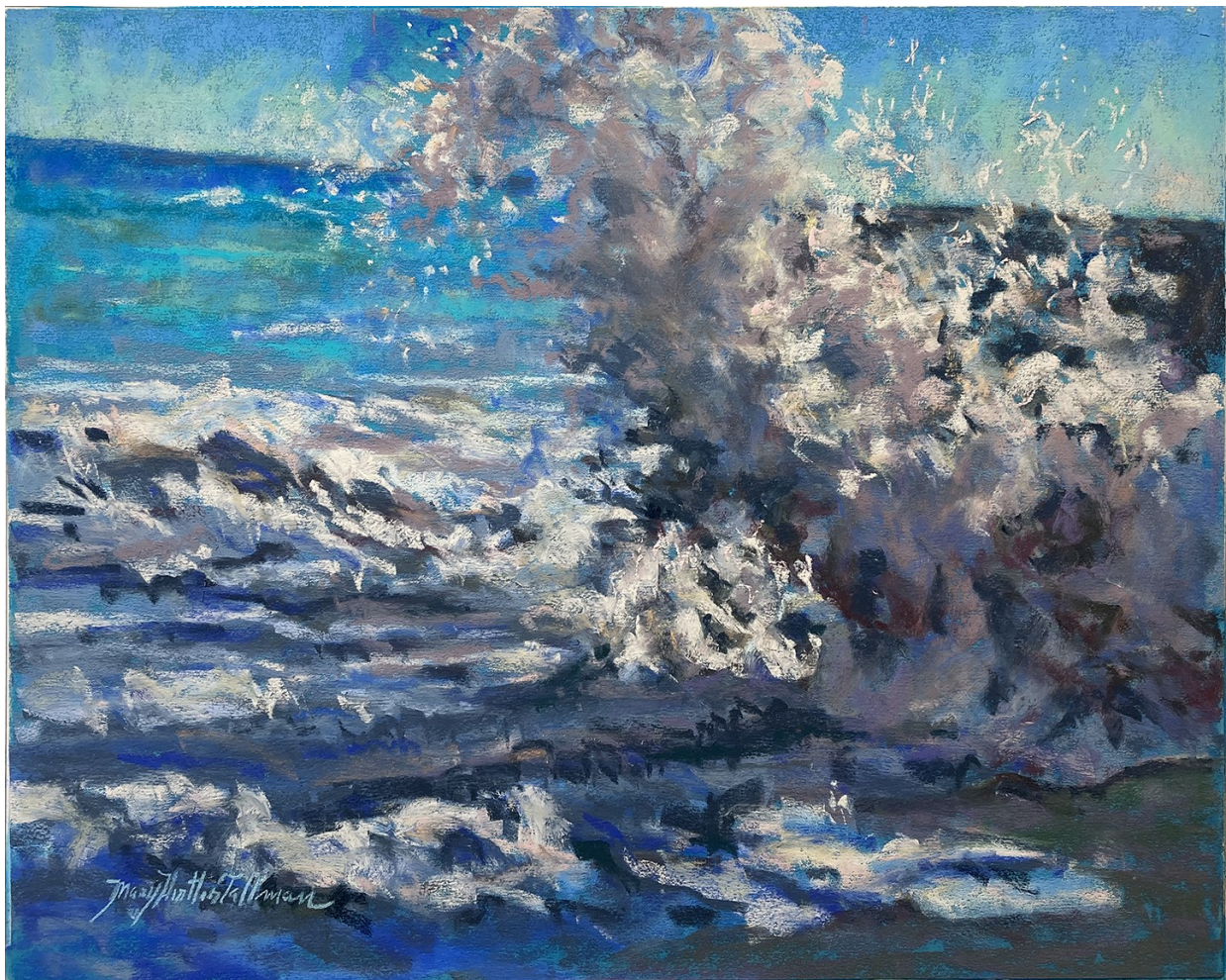
Florida Poetry—Shipwreck Beach—IX 16 X 20

I typically use white UArt 400 and use a hard pastel to create an underpainting all set with alcohol to tone the paper surface. I draw my composition with a contrasting watercolor pencil before I begin painting.