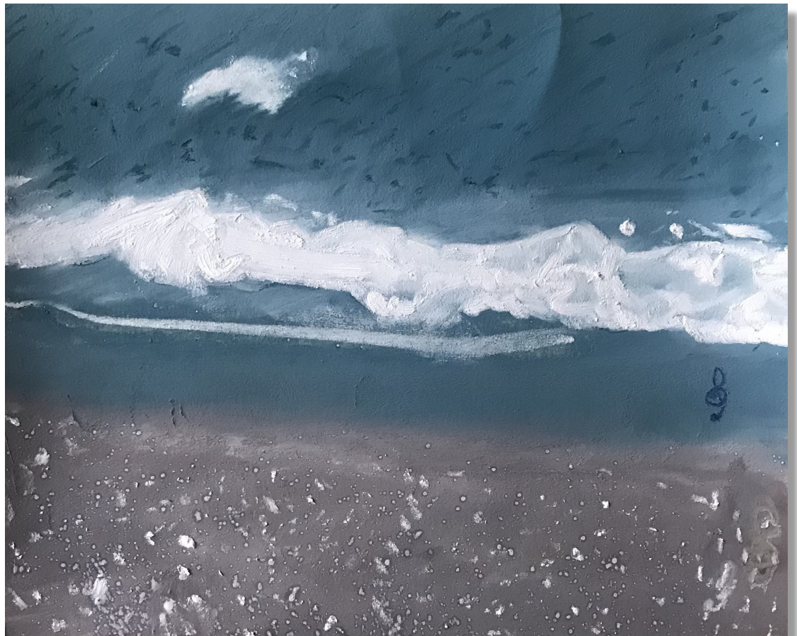
Where the Crabs Dance, and the Sandpipers Party