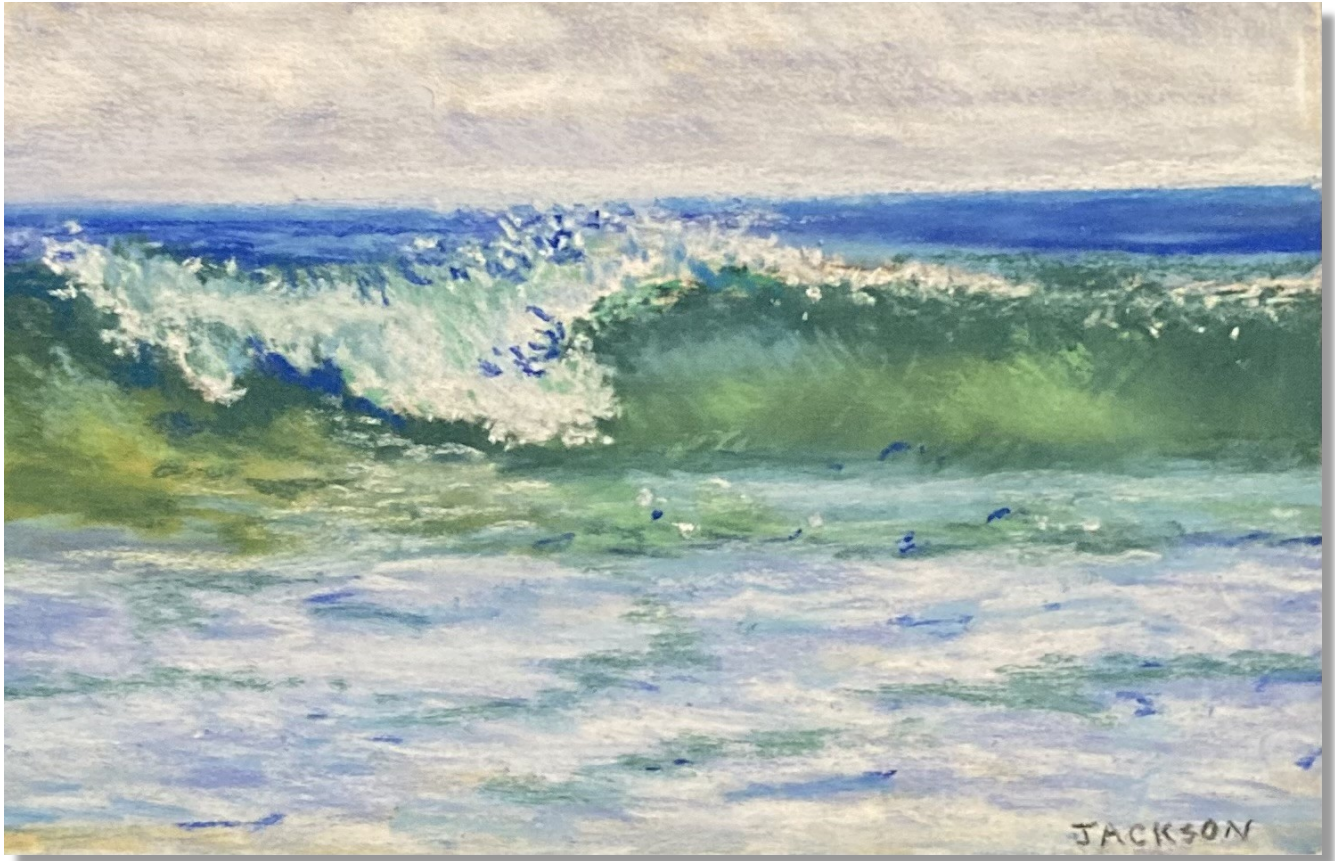
Enjoying a Wave 9 x 12

I normally do not paint seascapes, but I enjoyed trying to capture the energy of a wave. Lots of colors that I didn't imagine being there.