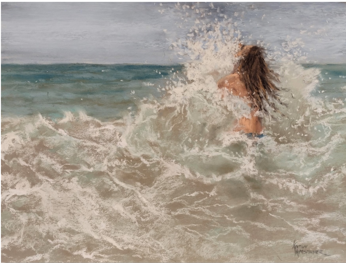
Splash Dance 9 x 12

I came across this photo I took at the Myrtle Beach State Park. The young man in dreadlocks caught a full wave. I love to swim in the ocean and I knew what he was experiencing at that moment. He just laughed out loud like a child, a sweet moment to watch!