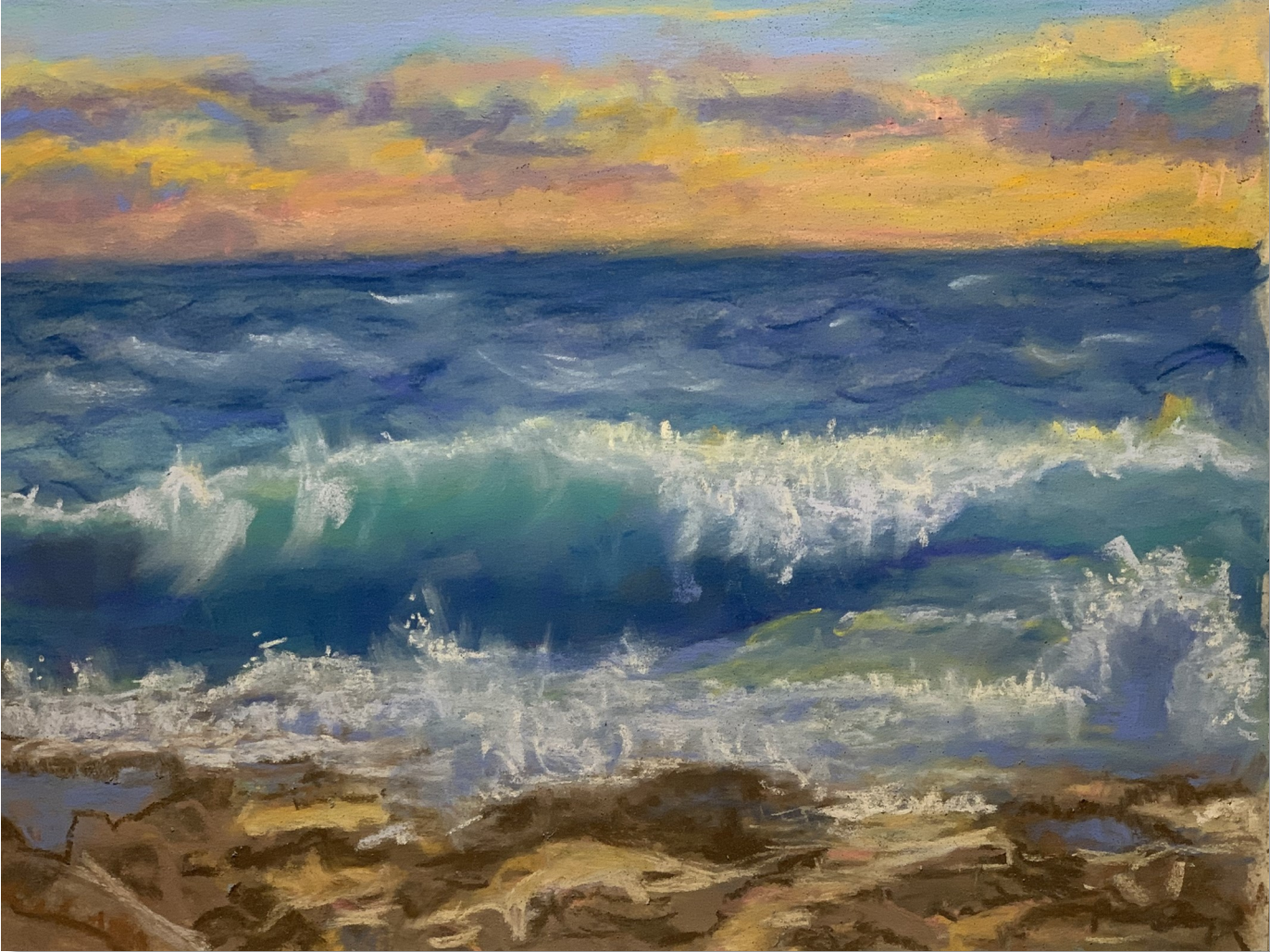
The Sea 9 x 12