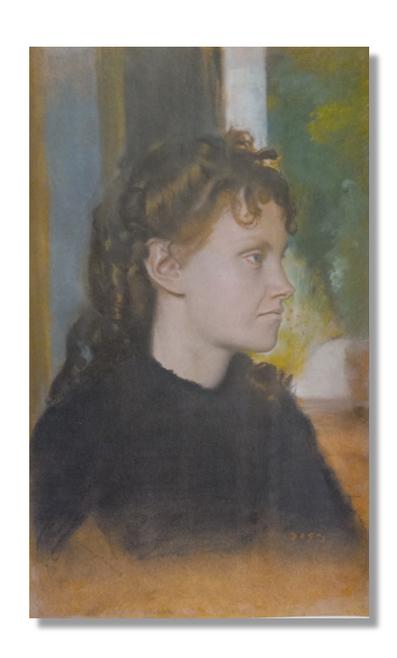
COMBINATION OF HARD, SOFT and LOST