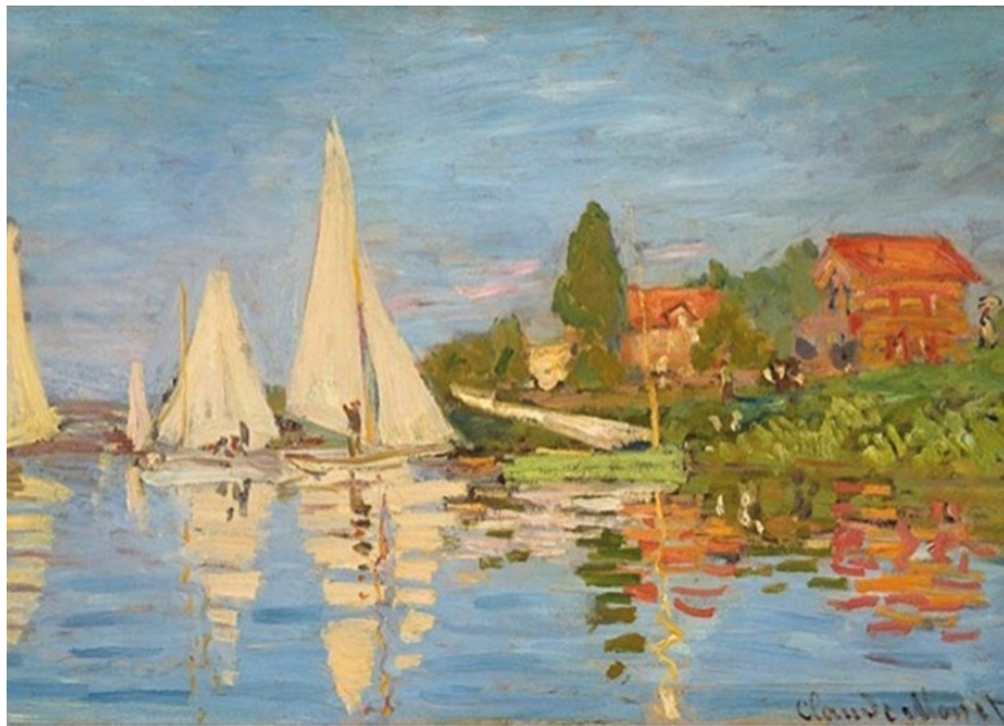
Claude Monet, Regatta At Argenteuil, 1872