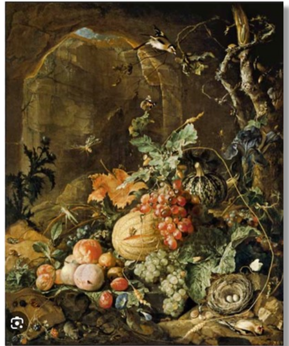
Great still life with the bird's nest - Jan Davidsz de Heem as art ...