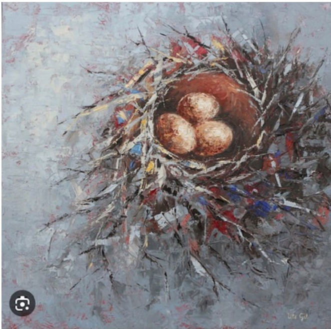
Ute Gil - Work Zoom: Birds Nest