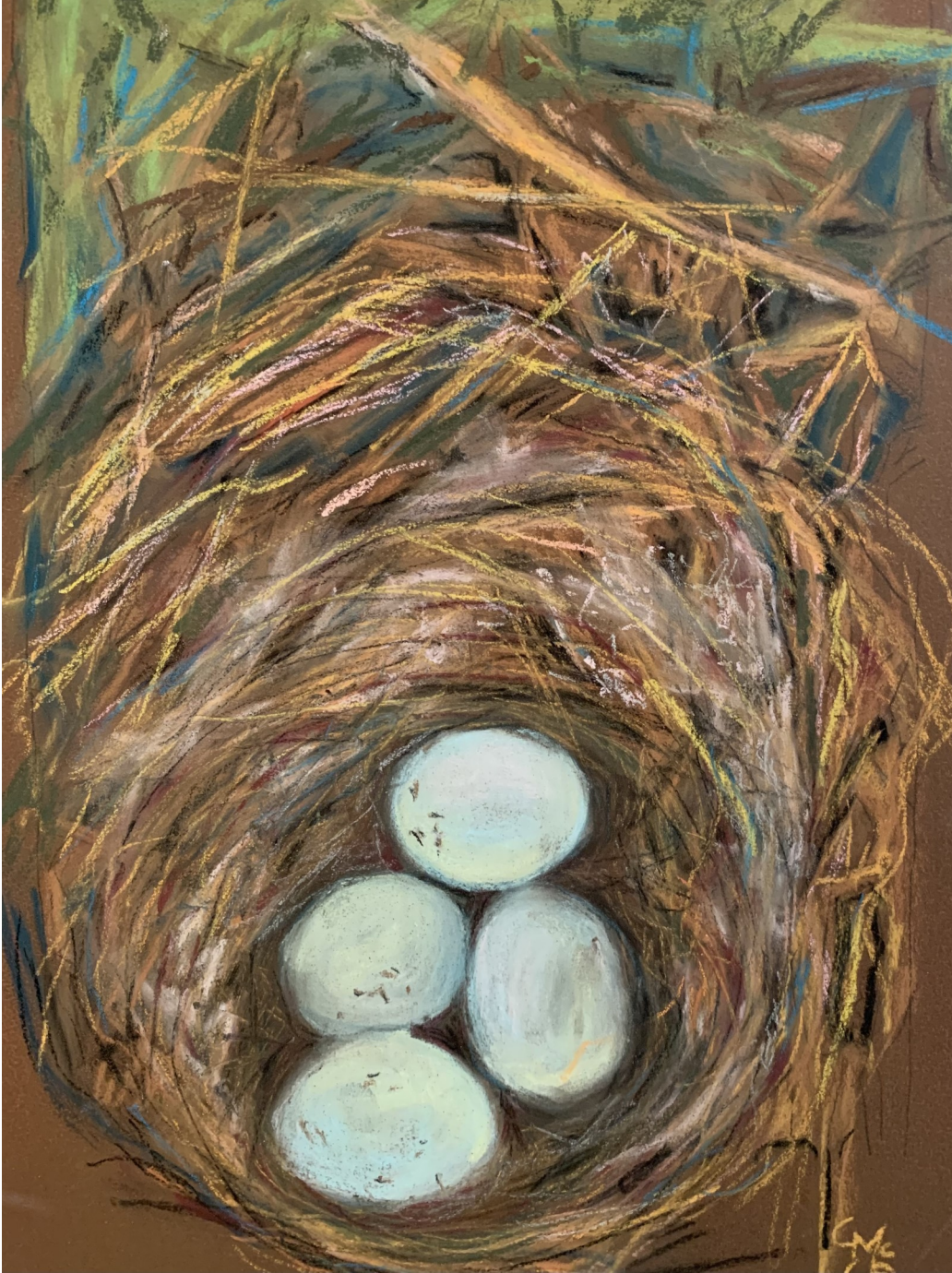
Sweet Bluebird Nest 9 x 12