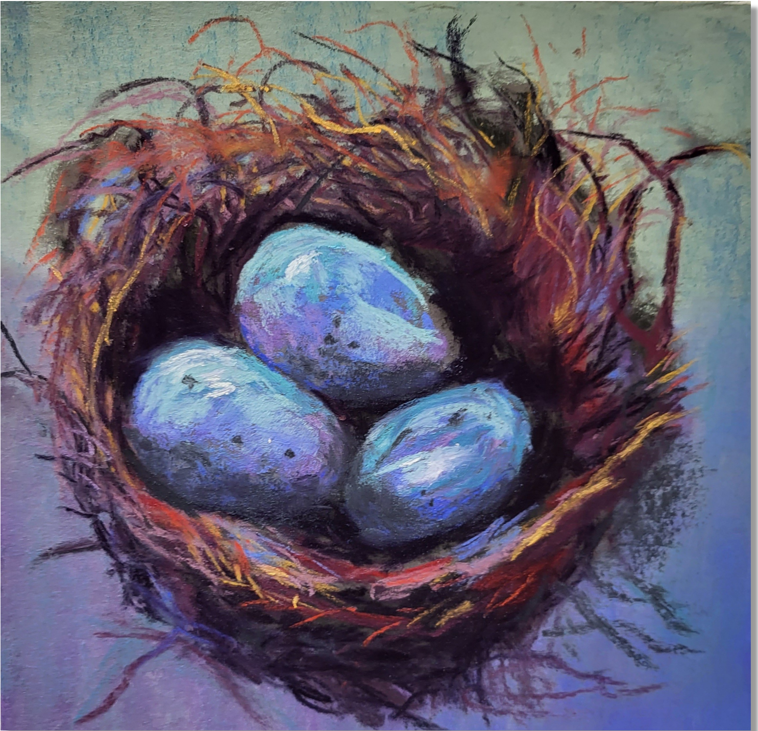
Blue Bird Nest of Happiness