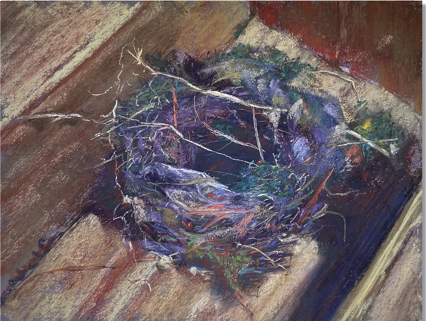
Treasures in the Yard