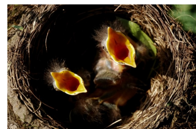
Hidden in Full View