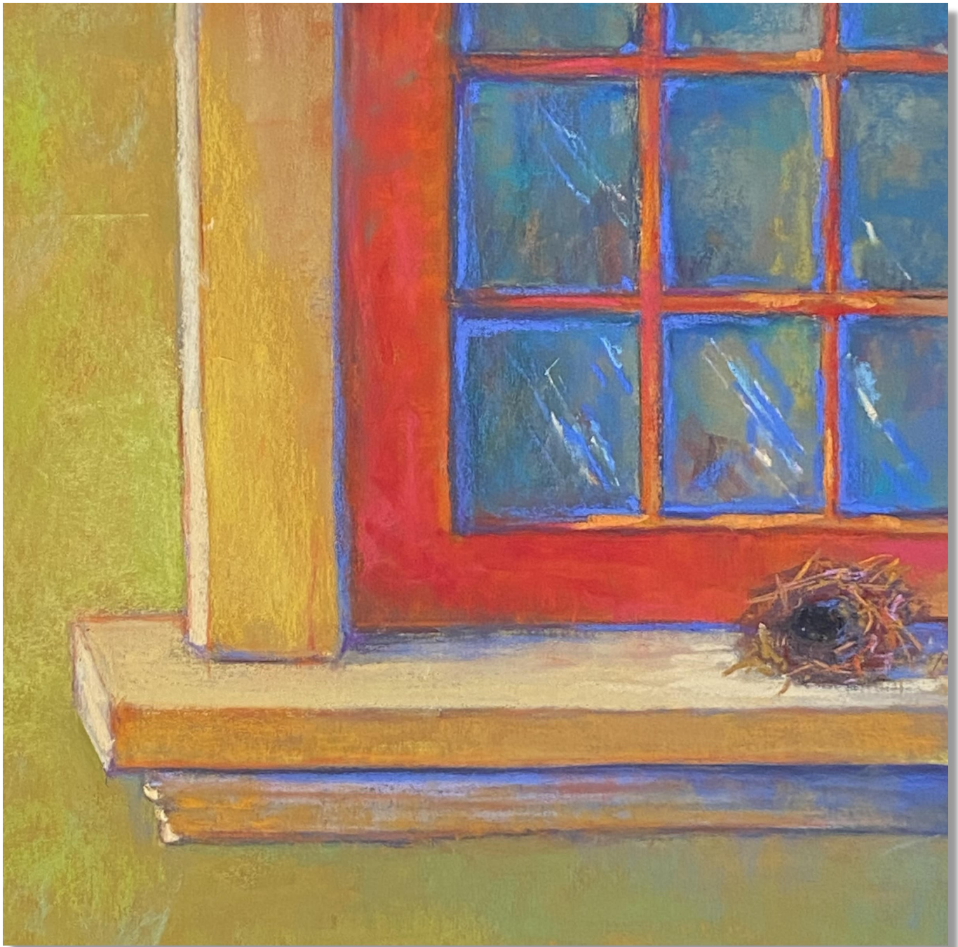
Empty Nest Syndrome

In this painting I chose to make the architectural part dominant, allowing the bird's nest to create contrast with all the sharp, straight lines. I felt the colors made for some additional excitement. The square format also added some useful tension.