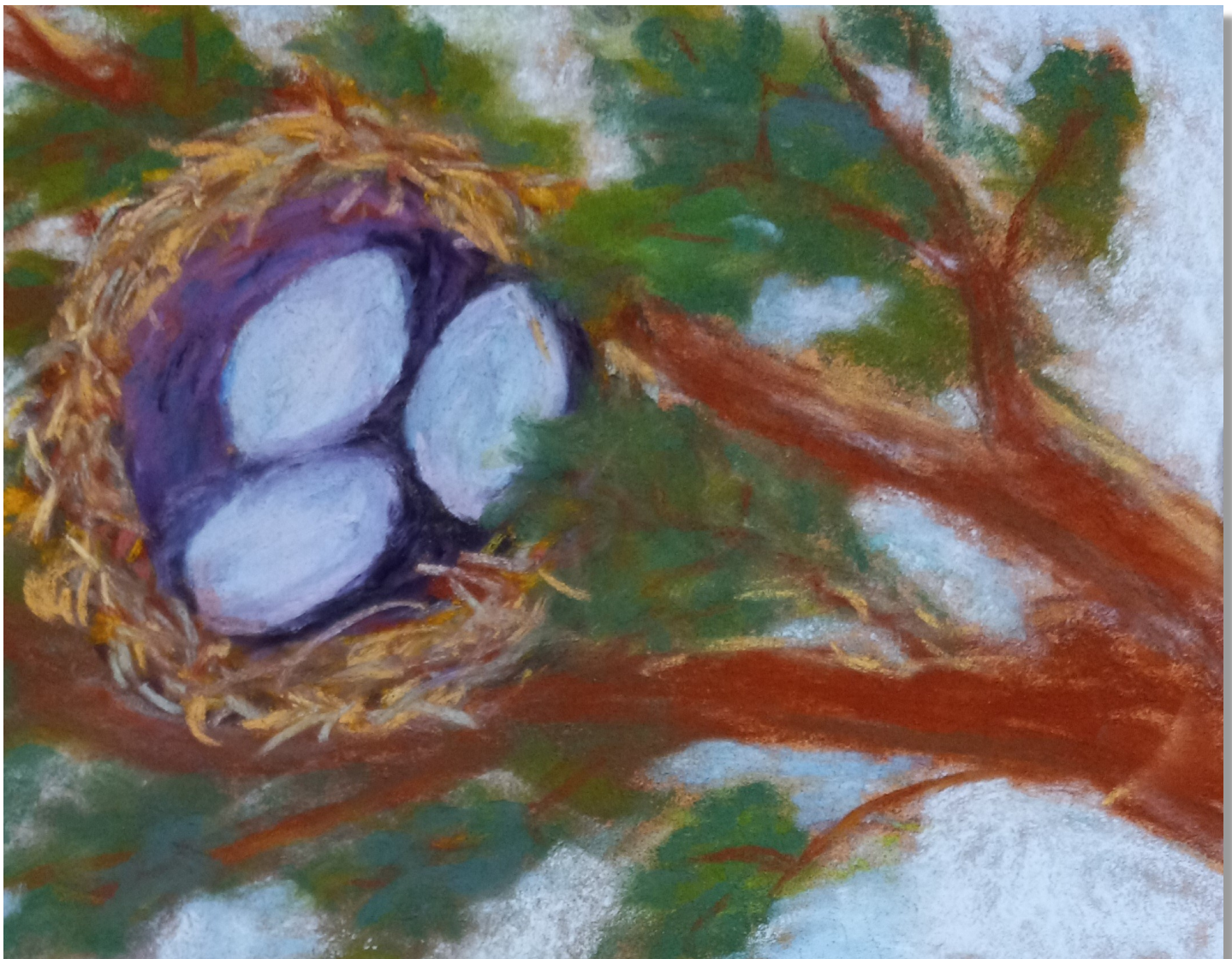
A Tree House for a Bird 6.5 x 8.5

I liked the challenge and will do some other bird nest's.