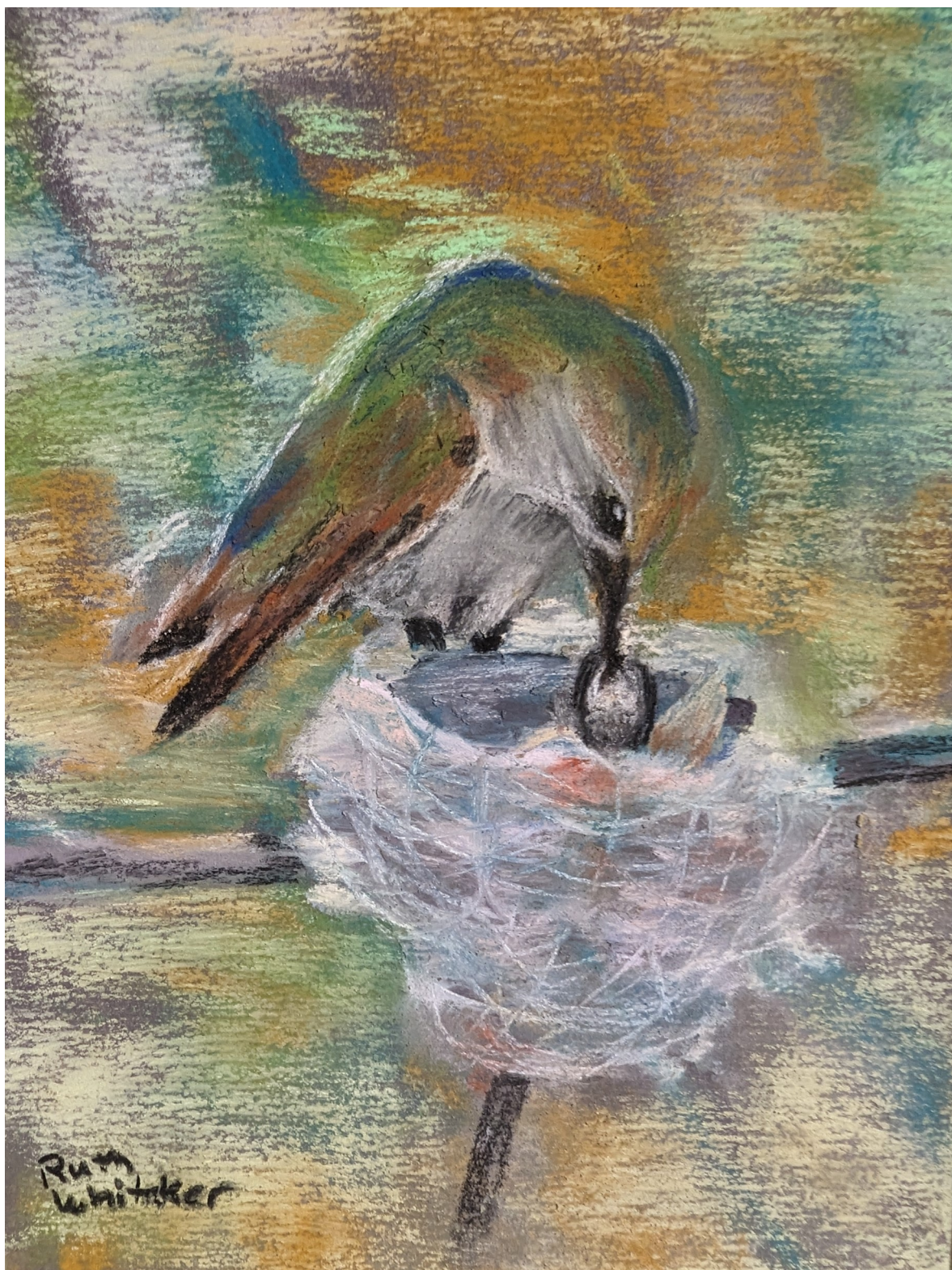
Feeding the Baby