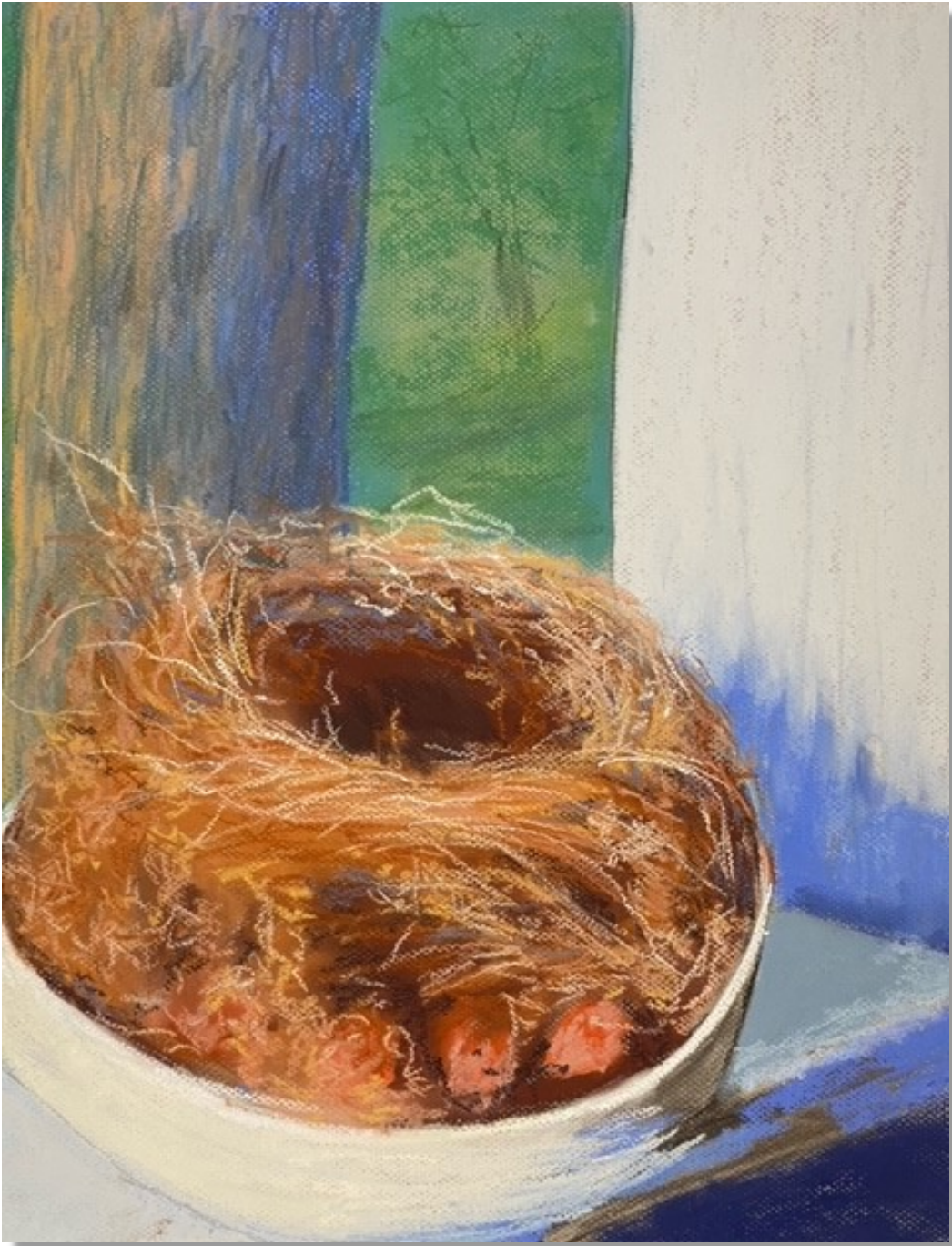
End of Season, 14" x 12", Canson board