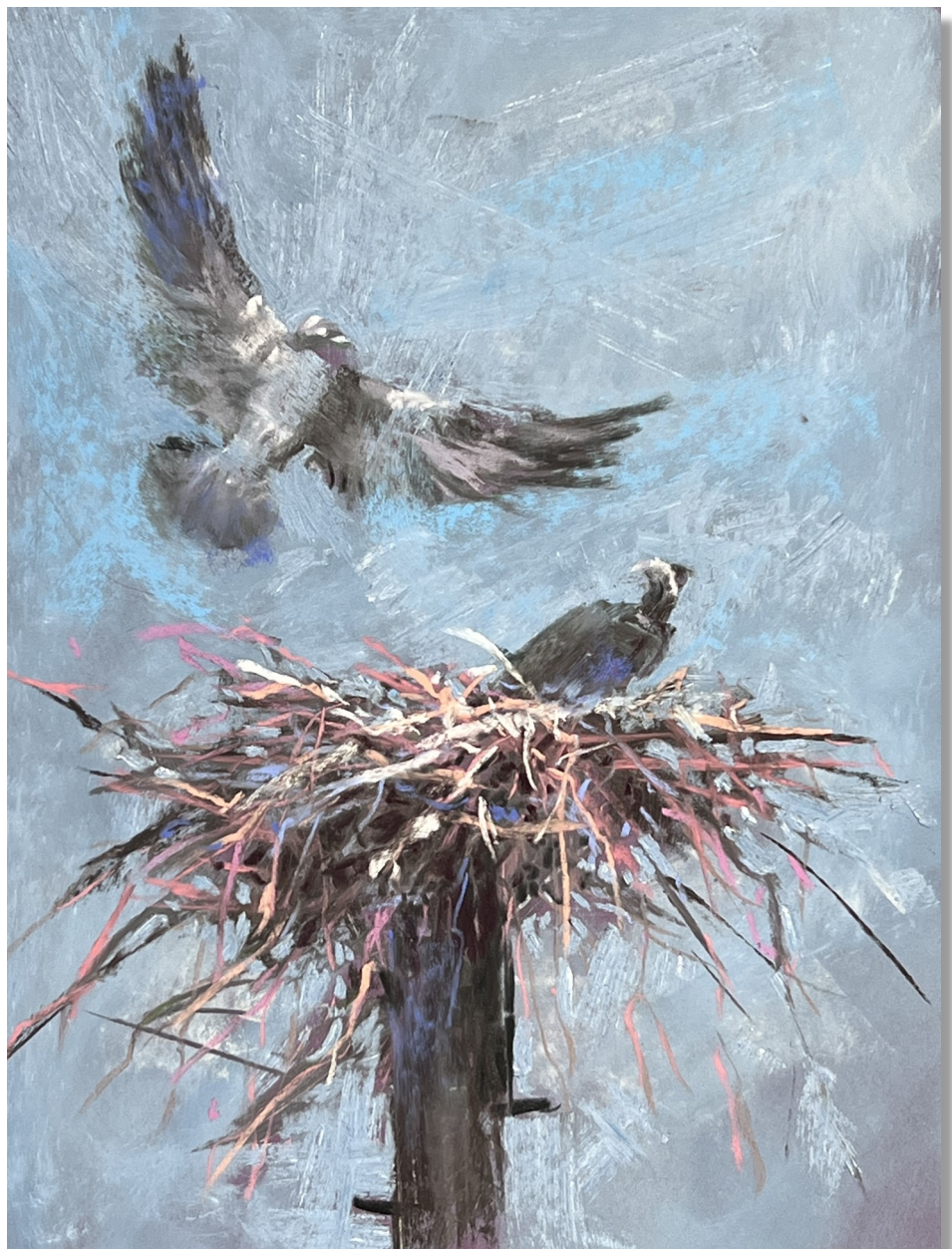
Osprey Nest 10 x 8