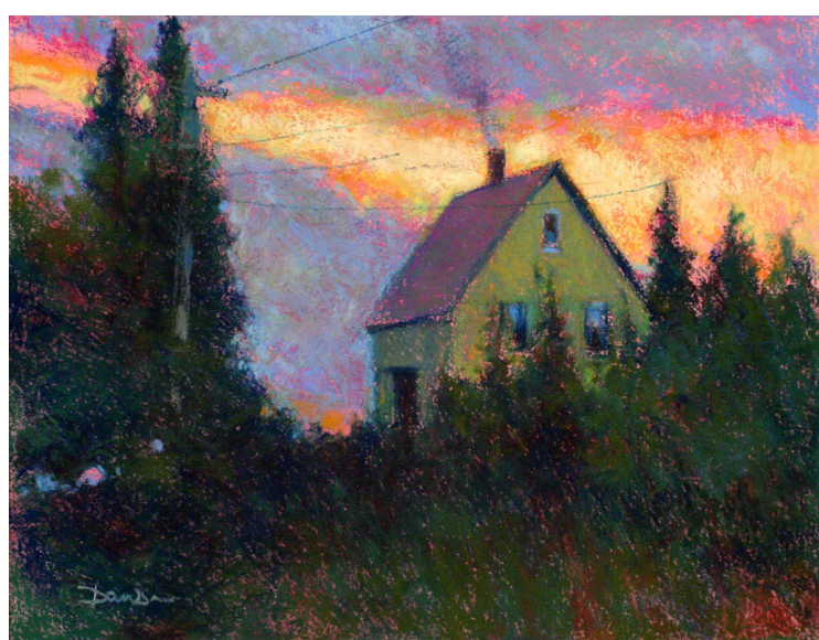
Break in the Sky