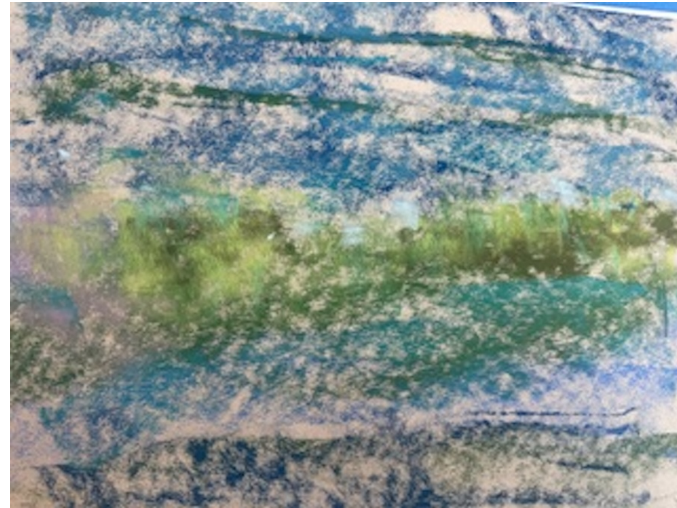
Adventure underpainting 12x 18 Uart