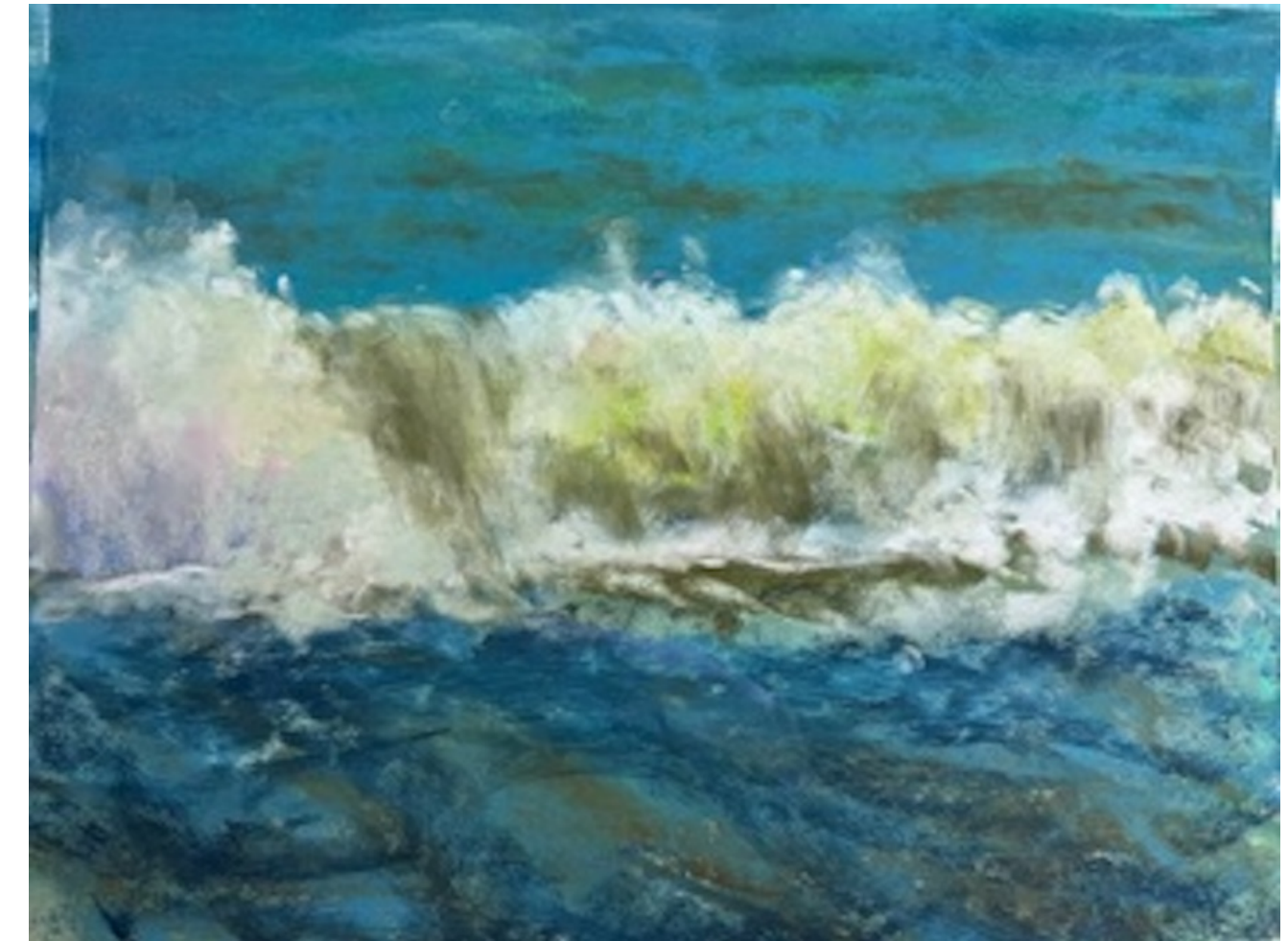
Far as I got to do, still more to do.