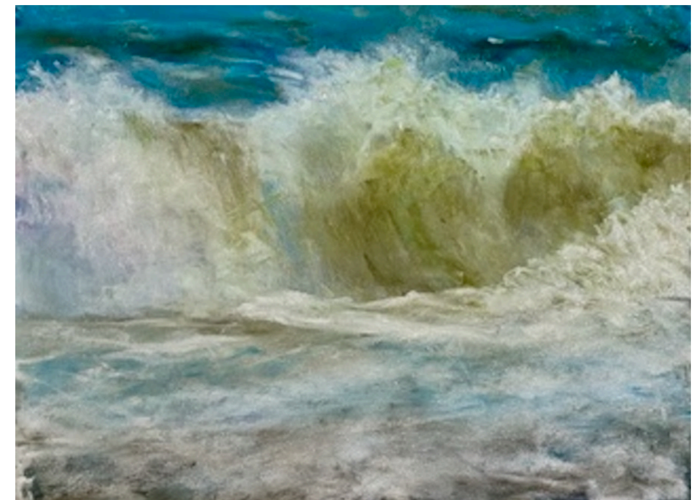
Painted along during the demo and this is my finished 9x12 Uart painting.