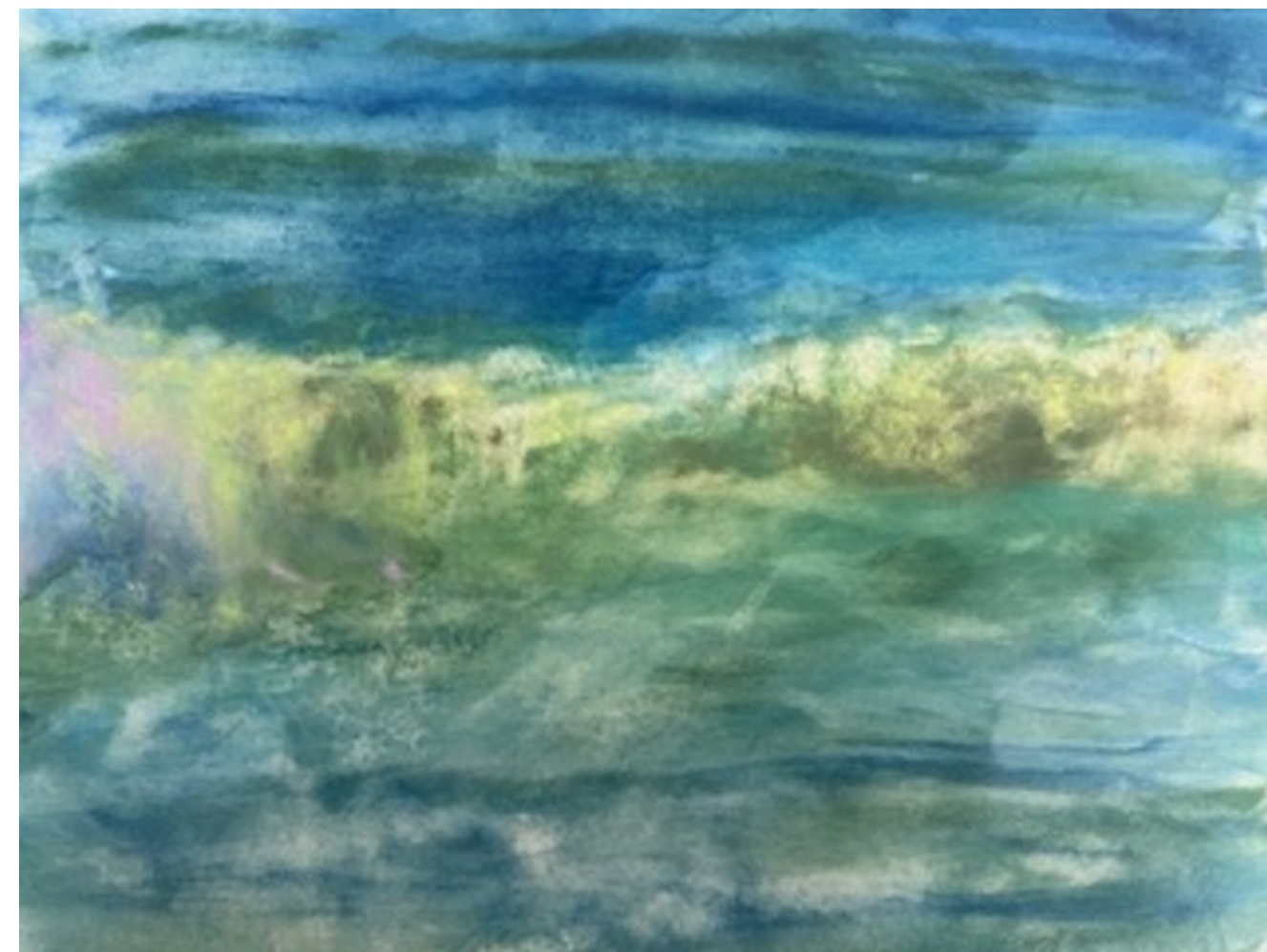
Adventure underpainting after alcohol applied. I had fun blotting it with a paper towel for texture.