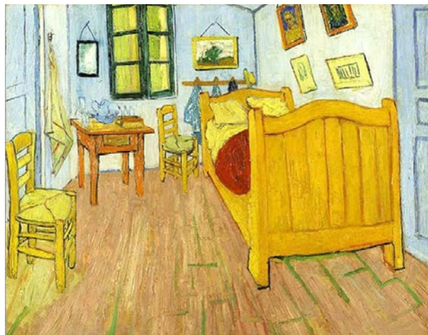
The Bedroom Vincent van Gogh