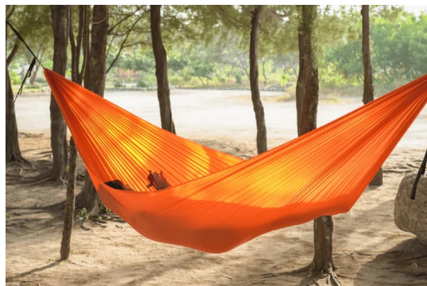
Your favorite summer spot!