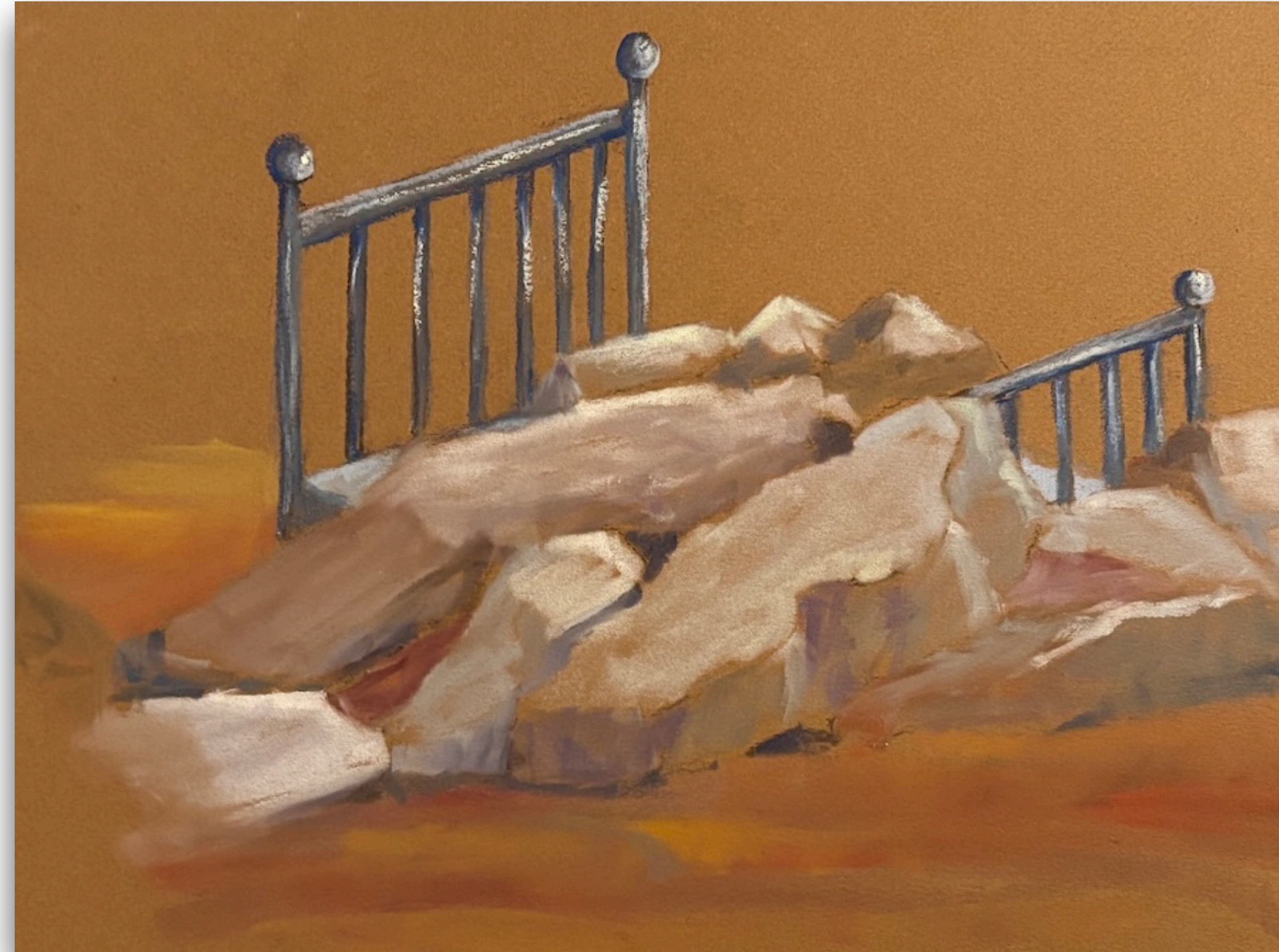
Title: "Bedrock" 7.5"x9.5"